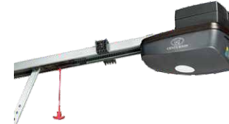
Garage Door & Gate Motor